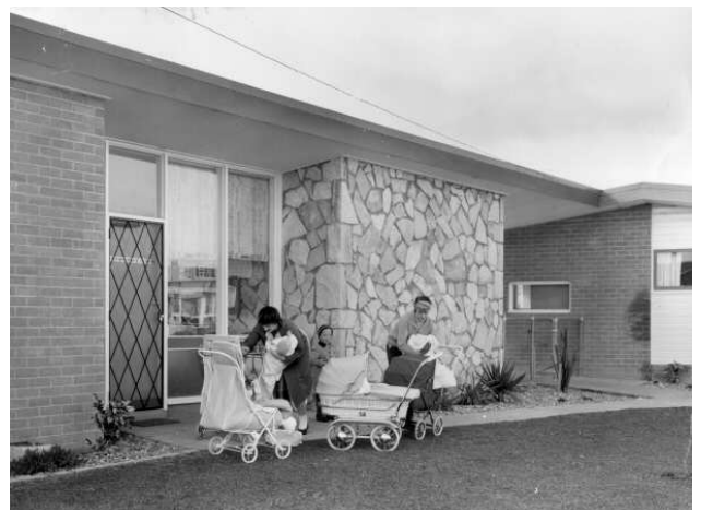
The old days: Downer Preschool and Mothercraft Centre, 1960s.

Downer Preschool turns 50 on 21 st May, so this year's Fete is going to be a special celebration. Come along and share your memories, pick up a bargain and support Downer Preschool.