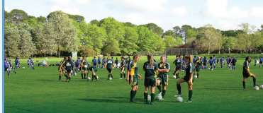
The Suburb and Community, Past and Present