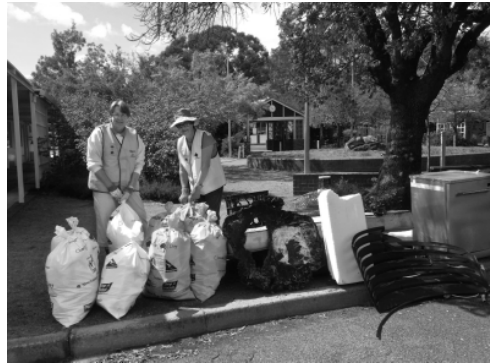
Dealing with the rubbish collected on Cleanup Australia Day 2014