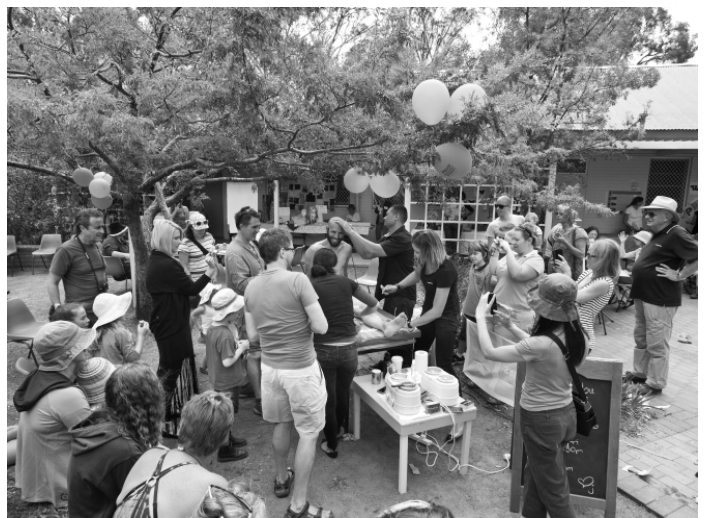
The big shave-off at the 2014 Party at the Shops